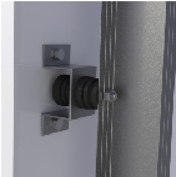
Vibro- WB Selection Table